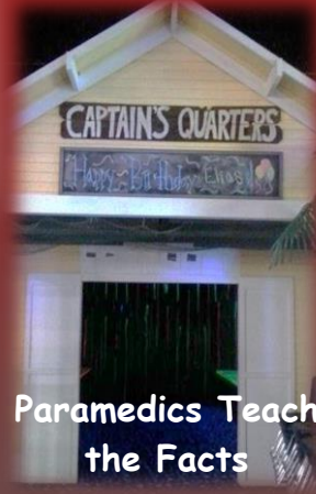
Paramedics Teach the Facts