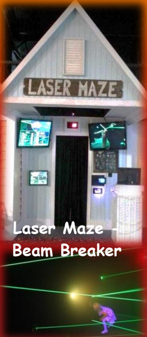
Laser Maze - Beam Breaker

Participation in the Education by at least one parent or guardian is required