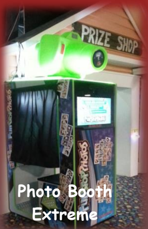
Photo Booth Extreme